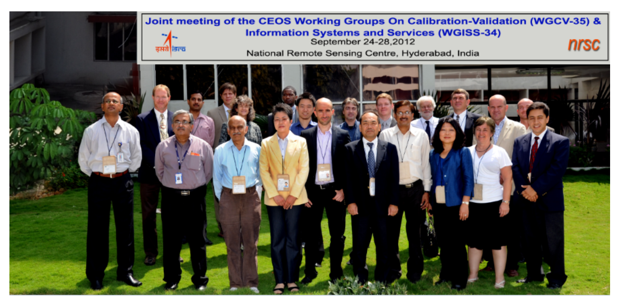
WGISS-34 Hyderabad, India, September 2012