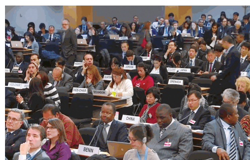
Participants in the 2nd Preparatory Committee meeting (17-18 November 2015, Geneva)

CEOS need to work closely with key actors, governments and international organizations to ensure a stronger role for EO from space in the coming decade.