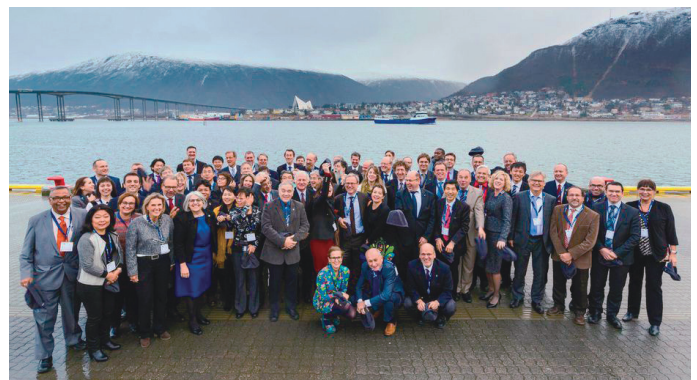
CEOS Plenary group photo

Finally, JAXA introduced their CEOS Chair Team and announced that the next CEOS Plenary would be held in Kyoto, Japan on 5-6 Nov 2015.