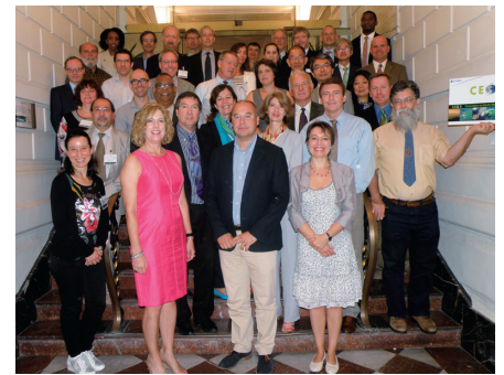
SIT Technical Workshop held in Montpellier from 16 th to 18 th September 2014