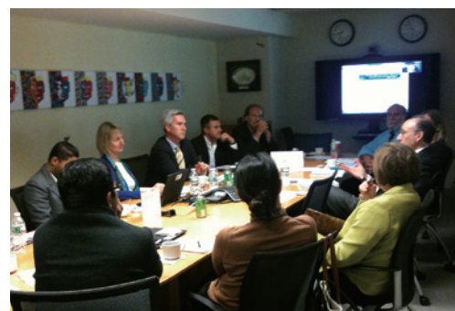
CEOS Recovery Observatory Oversight Team (ROOT) holds a working meeting at the World Bank in Washington, USA (December 10, 2015)

GEO-XII Plenary endorsed the transitional GEO Work Programme 2016, which includes the GEO-DARMA initiative (Data Access for Risk Management). For the Concept phase, this WGDisasters initiative seeks independent identification of disaster risk management priorities at the regional level by authoritative Regional Institutions, in line with the priorities of the Sendai Framework for Disaster Risk