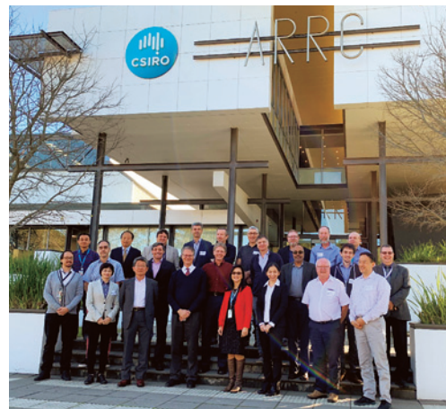
Delegates who attended the joint WGCV 45 plenary 16-19 July 2019 in Perth, Western Australia.

portal for all things related to calibration and validation of Earth Observation sensors. The next WGCV plenary meetings will be: WGCV-46 March 31- April 3 at Caltech, Pasadena, California and, will be hosted by NASA, and, WGCV-47 will be a joint meeting with WGISS, and will be hosted by ROSCOSMOS between 14-18 September 2020, Sochi, Russia.