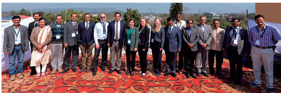
WGCapD-8 Annual Meeting in Dehradun, India March 6-9, 2019

The WGCapD-9 Annual Meeting will take place in Mountain View, CA between March 9-13, 2020. We hope you will join us!