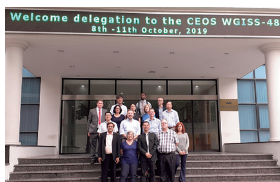
WGISS 48, VNSC, Hanoi, Vietnam 8-11 th October, 2019

The 49th WGISS plenary will be hosted by the Comisión Nacional de Actividades Espaciales (CONAE) in Buenos Aires, Argentina, week of April 20 th , 2020. WGISS 49 will include a dedicated workshop on CEOS Services and Tools, extending its work on EO data discovery to the growing area of EO analytics services. In addition, there will be working sessions on Data Cube interoperability and ARD in the Cloud. All material, information and contacts can be found at: http://ceos.org/ourwork/workinggroups/wgiss/