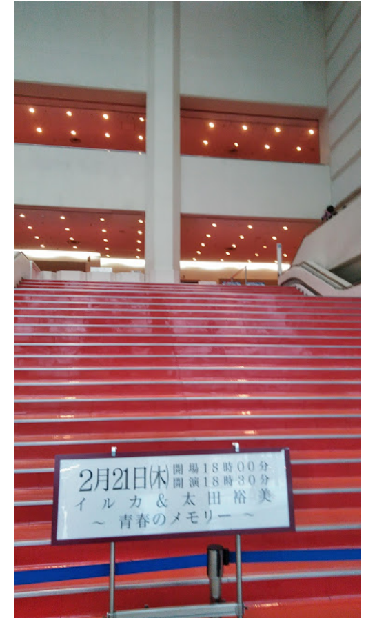
1 st floor the concert hall