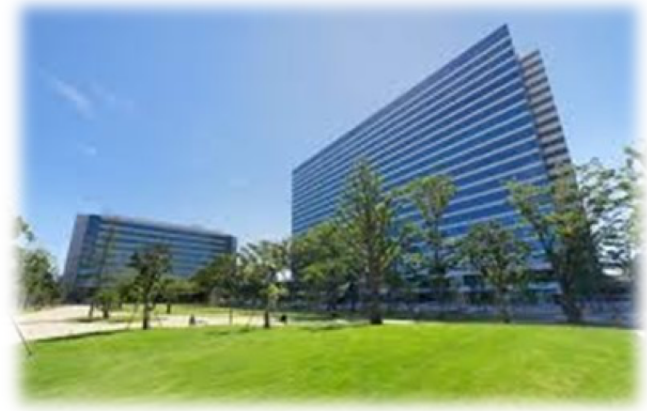
Nakano Central park, three universities, Kirin Brewery HQ