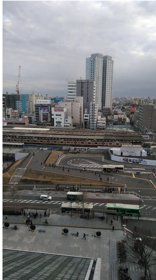
JR and Subway Nakano Station from the Sun Plaza (8 th floor)

Up to 123 (three per desk) The best for 80 (two per desk)