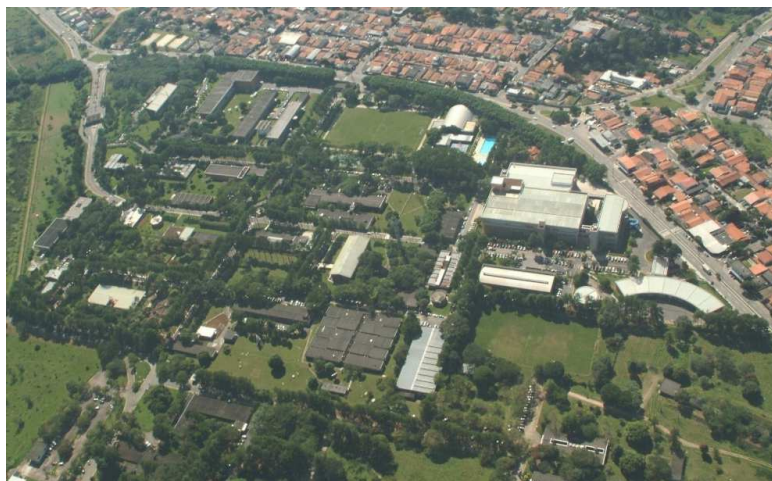
Aerial View of INPE in São José dos Campos