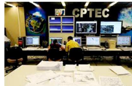
Weather Forecast and Climate Studies