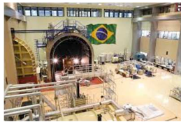
Laboratory for Integration and Tests