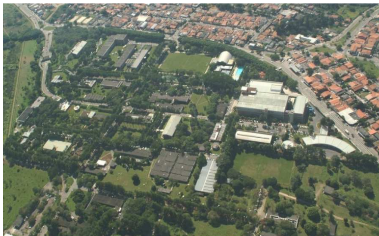
Aerial View of INPE in São José dos Campos