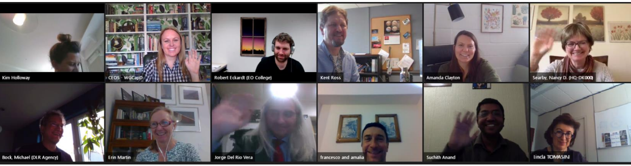
Several WGCapD-9 participants share a goodbye at the end of the meeting.