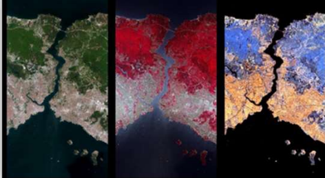
Istanbul, Bosporus, Turkey; 2022/04/27; first light