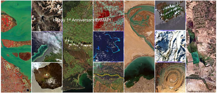
1<sup>st</sup> Anniversay Collage