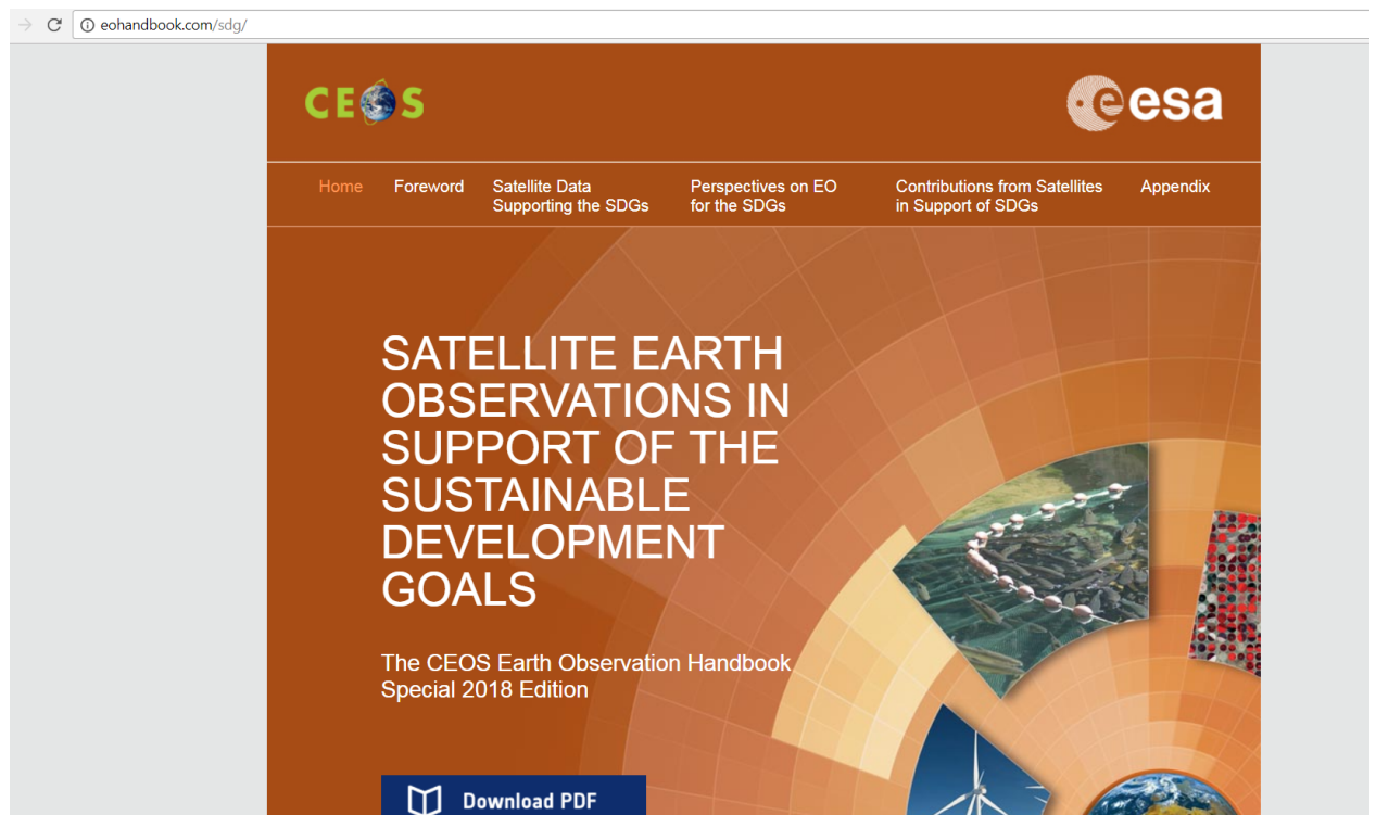
Figure 2 CEOS Handbook online (printscreen)