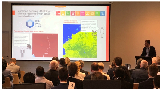
(Satellite Applications Catapult)