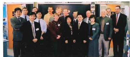
Participants of the WGISS-13 at NASDA HQs

ESA/ESRIN hosted the WGISS Subgroup meeting in Frascati, Italy, May 6-10, 2002. More than 50 delegates attended this meeting. In addition to the regular review of the work of the Task Teams, this meeting featured a workshop on GRID. GRID is a suite of software that supports the sharing of all manner of distributed computer resources. It is used to support distributed, collaborative science projects. Several international experts gave presentations on GRID and on its applicability to the WGISS Earth Observation environment. After this workshop WGISS decided to initiate a Task Team to conduct a Pilot study on an EO problem using GRID technology. WGISS subgroup members would like to thank to the ESA ESRIN hosts for a very productive meeting. The next WGISS Subgroup meeting will be hosted by NASA in Alexandria, Virginia,