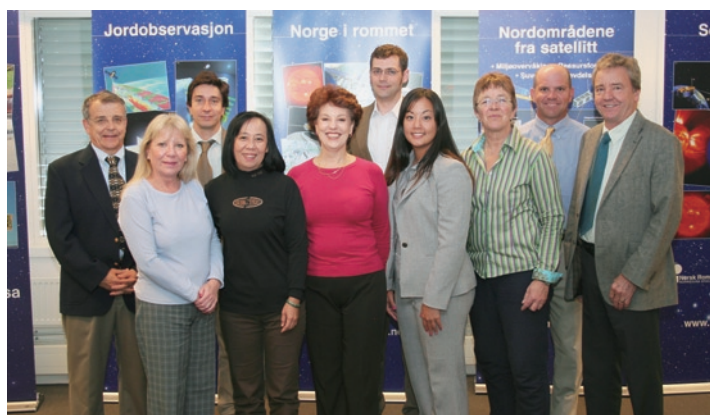
The group of WGEdU

Finally, WGEdU agreed that its next annual meeting will be held in Argentina, at the kind invitation of CONAE, in the May 2010 timeframe. ■