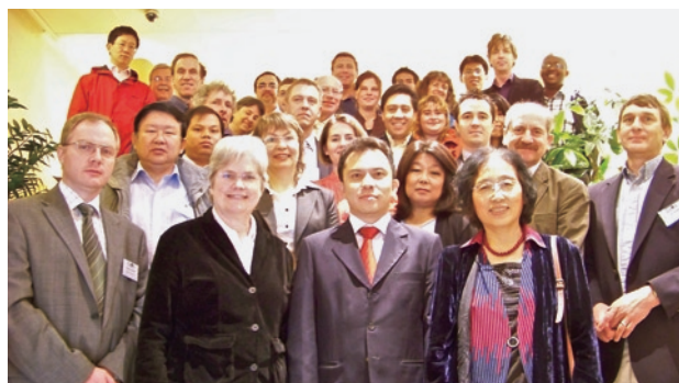
The group of WGISS

Also notable at the meeting, WGISS learned that INPE will be providing tools for the LSI Constellation, which will be