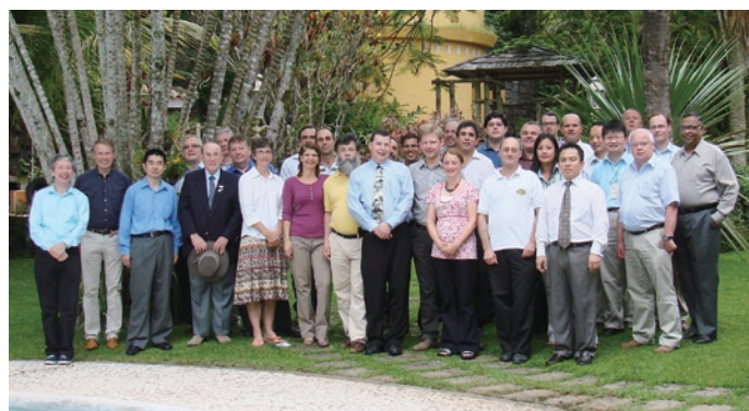
Participants to the WGCV's 30 th plenary meeting in Ilhabela, Brazil

Much of the WGCV's work currently focuses on the GEO / CEOS tasks, and a day of the meeting was dedicated to discussion and review on the tasks the group is involved in. The WGCV is involved in many activities ranging from sensor intercomparison exercises over land (e.g., at DOME C and in Turkey) and sea (e.g., off the coast of Miami), to the definition of a global set of Cal/Val test reference sites, to benchmark mission coordination efforts, to the establishment of a global DEM. A major focus of effort through the tasks has been on the Quality Assurance Framework for Earth Observation (QA4EO) and its implementation. QA4EO was adopted by CEOS plenary last year and, since then, has undergone a further thorough review by GSICS. Issue 3.0 of the QA4EO framework and its ten guidelines have now been released and are available from the QA4EO website at http://qa4eo.org/ . A short user guide has also been produced to assist the user in implementing QA4EO (this can also be accessed via the QA4EO