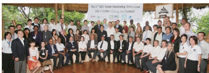
Participants of the 2nd GEO Forest Monitoring Symposium

You should by now have received information on the 2009 CEOS Plenary, which we will host on 3-5 November at the Sheraton Grande Laguna hotel on the beautiful island of Phuket in the south of Thailand. We hope that the meeting will include extended discussion on strategic issues. I look forward to welcoming you all there. Agenda and registration info will follow shortly. ■