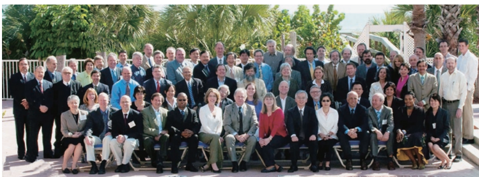
SIT-23 Participants, Cocoa Beach, Florida