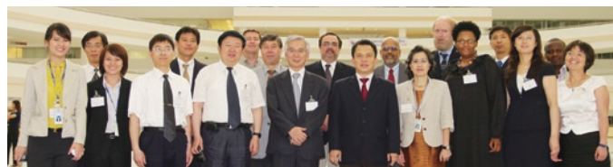
Troika and ASIA-CEOS meeting Participants