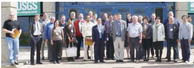
WGCV IVOS participants at the USGS EROS, May, 2012

The WGCV greatly appreciates the strong contributions and active participation by the Australian representatives and encourages