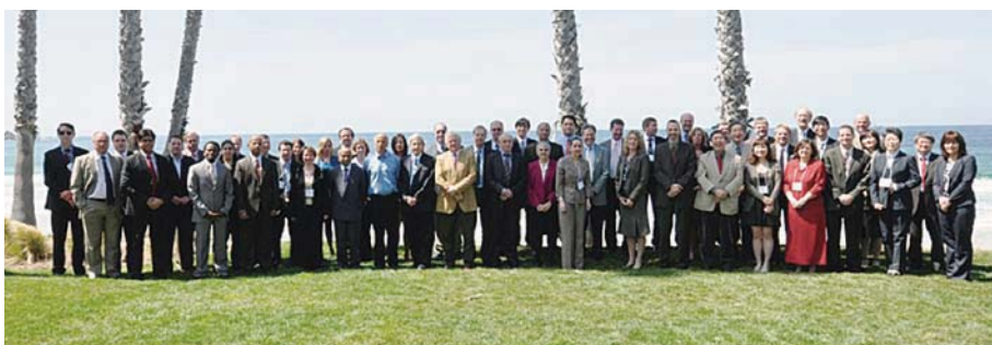
SIT-27 at Scripps Institution of Oceanography, March 26-30, 2012, La Jolla, California, U.S.A.

Finally, I commend our Virtual Constellations and Working Groups for their purpose-driven coordination and collaboration. At the end the day, in every time zone across the globe, this is the main reason for our existence.