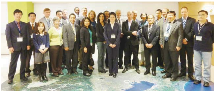
WGISS-33 participants in Tokyo, April, 2012

In order to prepare effectively for future meetings, WGISS needs guidance from SIT and/or Plenary on any specific areas on which we should focus. As requested at the 27 th SIT meeting, WGISS continues to seek additional participation and funding. WGISS is always open to any CEOS members or associates and would like to request from CEOS principals continuous and stronger support in order to accomplish CEOS core business assigned to WGISS.