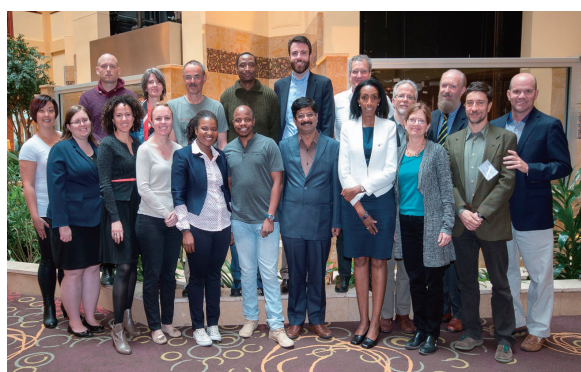
WGCapD 5 th Annual Meeting Participants

Another very exciting activity that was completed by the Working Group is to Build awareness and demonstrate the value and applications of earth observation targeting teachers, students and practitioners in major conferences. The joint School Lab during the Living Planet Symposium 2016 in Prague targeted Czech secondary school students and teachers. Members of WGCapD from ESA and DLR hailed the event a very successful initiative. With more than 280 participants it had a great impact, raising awareness and demonstrating the principles of remote sensing and Earth Observations and show case activities of ESA, ESERO CZ, DLR and National Space Academy.