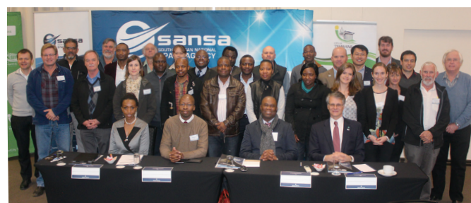
Figure 2: GEOGLAM RAPP workshop group photo in Pretoria