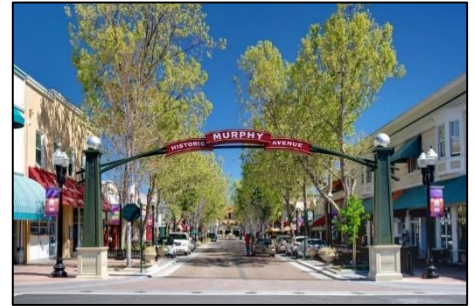
City of Sunnyvale

The city is a center of technology and innovation, but also a town of quiet family neighborhoods, strong schools, and a diverse community of people. Sunnyvale's historic downtown, home to a variety of local eateries and merchants, hosts frequent art festivals, concerts and a year-round farmers' market. The city takes immense pride in the thoughtful leadership and dedication to community that has made Sunnyvale the true heart of Silicon Valley.