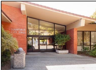
Sunnyvale City Hall

Sunnyvale was given its current name in 1901 due to its location in a sunny region next to more significantly foggy areas. The town grew as industry developed, including dried fruit production with the opening of a fruit-packing factory by meat-packing company Libby, McNeill & Libby in 1906 (known in the modern era as Libby's, which is famous for canned fruit cocktail). In 1912, residents voted to officially incorporate the city and the first high school opened in 1923. The second female mayor in the history of the state of California, Edwina Benner, was elected to her first term as Sunnyvale mayor in 1924. Following World War II, the area's fruit orchards and sweetcorn farms were cleared to build homes, factories and offices. Since 1956 and the arrival of aircraft manufacturer Lockheed, numerous high-tech companies have established offices and headquarters in Sunnyvale.