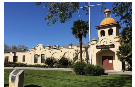
Joshua Hendy Iron Works Museum

The Joshua Hendy Iron Works, a company originally established in Sunnyvale from San Francisco in 1906 to produce mining equipment and then steam engines, is now a museum located within the Northrop Grumman plant and tours are open to the public by advance scheduling.