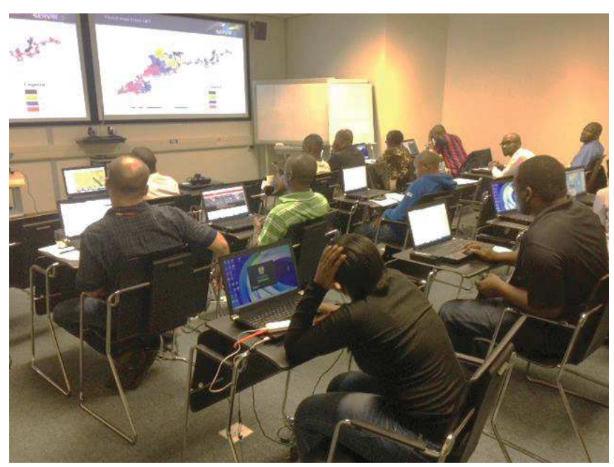
Participants listening to a lecture.

There were also invitees from other Southern Africa countries. Support for travel and accommodation was provided to 17 non-South African participants. A detailed list of the participants can be found in Appendix B.