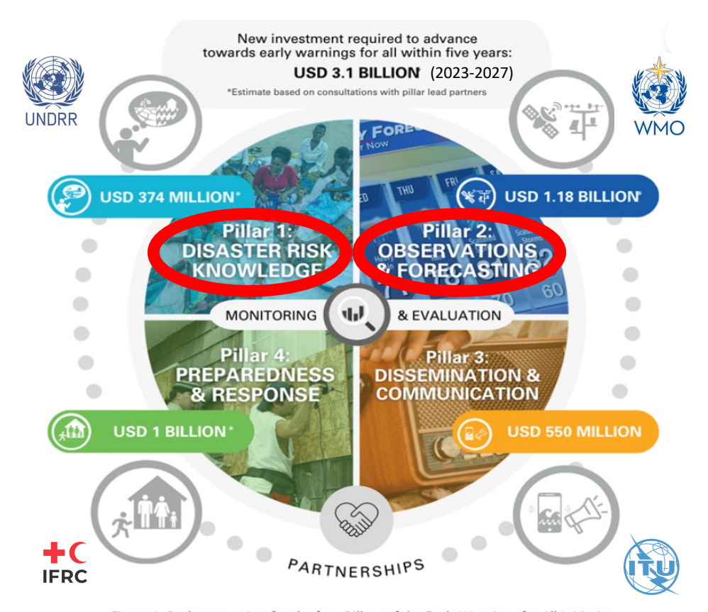
Figure 1: Budget overview for the four Pillars of the Early Warnings for All Initiative