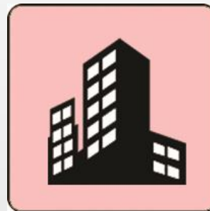
Common Infrastructure and Services