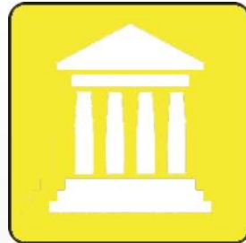
Governance and Policies