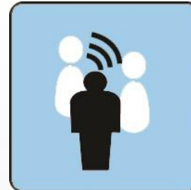
Awareness Raising and Capacity Building